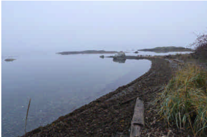
8:23 SE View at Beach Access