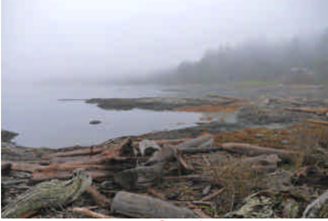
7:59 SW View