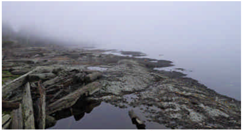
8:11 NW View