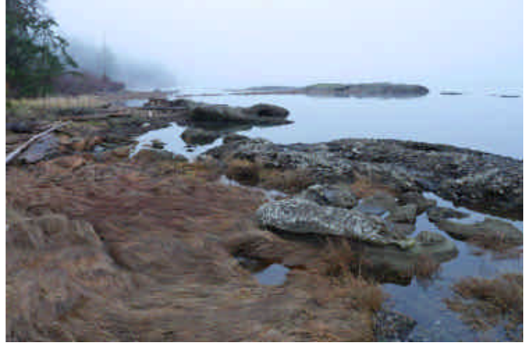
8:20 NW View