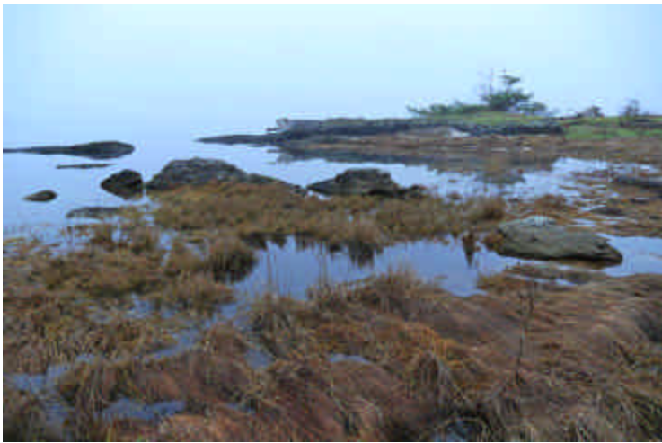
8:18 SE View