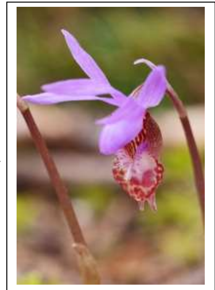
Calypso orchid whose hardy leaves emerge in autumn and last through winter even under snow.

Since early 2015, two grants have been provided by the Habitat Stewardship Program, via the BC Ministry of Environment, to carry out vegetation control to help foster the growth of food and nectaring plants for the Checkerspot larvae and breeding adults. In early 2015, small trees and Scotch broom were cut down in the Butterfly Reserve area. Between September 2015 and January 2016 DCA hired local Denman Islanders to remove more small trees, Bracken fern and Scotch Broom, and clear trails in and around the Reserve. New signage has been installed which marks the corner boundaries of the Reserve, and alerts trail users to the sensitivity of the habitat and species within the area.