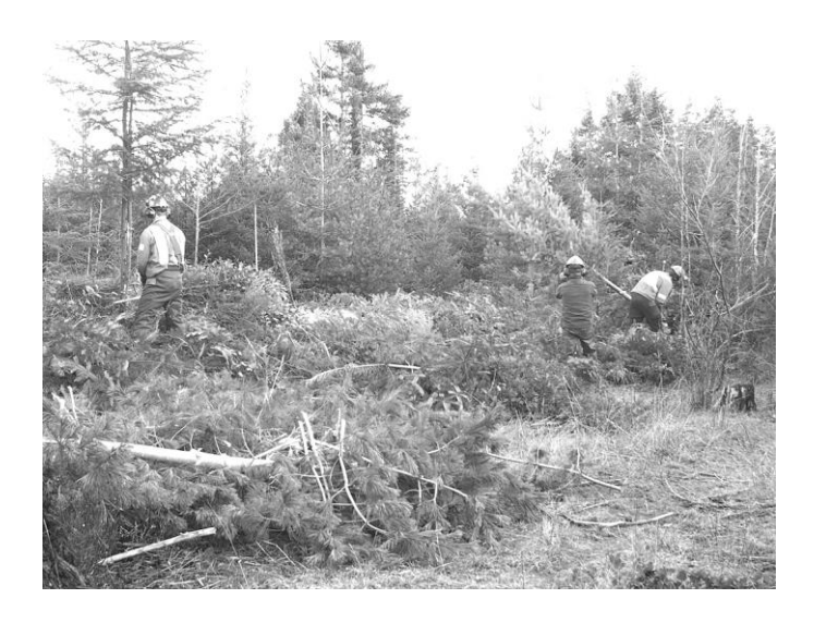
Above & Beyond Tree Service fallers at work in the Settlement Lands

A current membership is required in order to vote on DCA society matters. Volunteers will be available before the meeting commences to accept a minimum $10 donation from those who wish to renew their membership.